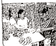
figure Many schools figure out ways to reuse paper instead of throwing it away.

earn These students are trying to earn enough to help buy new library books.